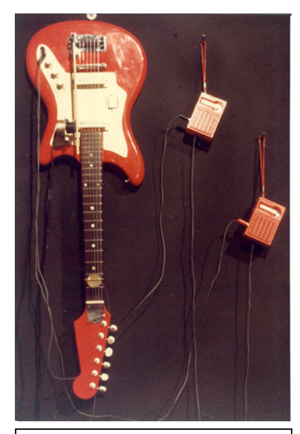
Figure 2: Installation of Killed In A Bar at PS1, NYC, 1982.

I built a backwards bass and another guitar and formed a band. Via a computer-controlled matrix switcher the players could call up a range of driving signals, from radios and prepared cassette tapes, to microphones into which they could talk or sing. The major piece done with this group was A Letter From My Uncle (1984).<sup>11</sup>