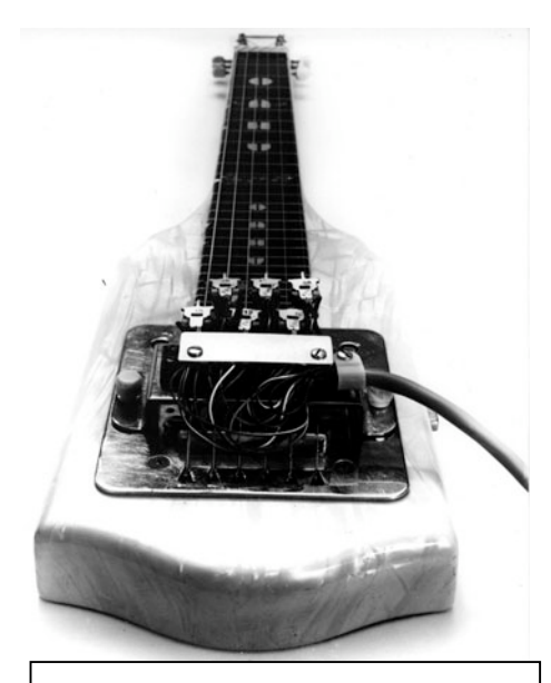
Figure 5: Backwards Hawaiian guitar, 1987.

I began designing a new instrument for me to use as a soloist. I had grown tired of schlepping a guitar case in addition to my usual heavy suitcase of electronics. Moreover, having never been a "proper" guitarist, I was not entirely comfortable slinging one on stage (hence my preference for hiring rock musicians like Poss.) A tabletop instrument seemed attractive, since it would make it easier for me to wrangle all the other electronics connected to the guitar, so I bought a lap-steel Hawaiian guitar short enough to fit in a suitcase.<sup>13</sup>