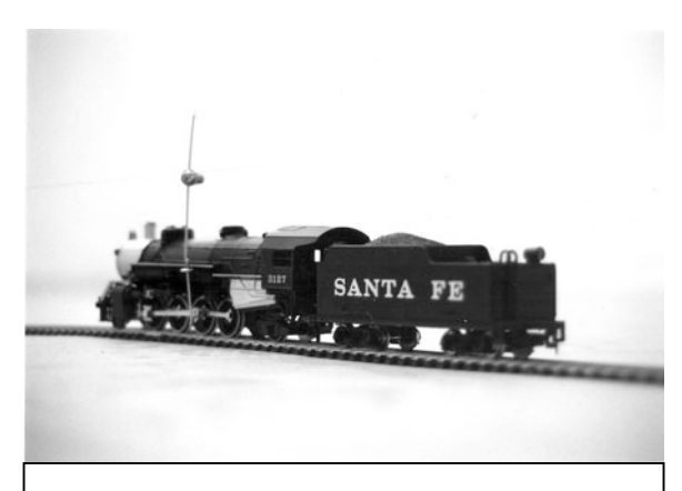
Figure 7: Under The Sun II, Het Apollohuis, 1987.

At the same time that I was developing the backwards guitars as performance instrument I created a series of installation pieces based on similar interests. After the selfplaying guitar of Killed In A Bar I returned to the single long string of Under the Sun with Under The Sun II in 1986. I stretched a steel wire over a length of HO train track, and rigged a mechanism to the reciprocating rod of the locomotive's piston so that the train plucked and banged the wire as it moved. Trundling down the track, the train played overtones of the