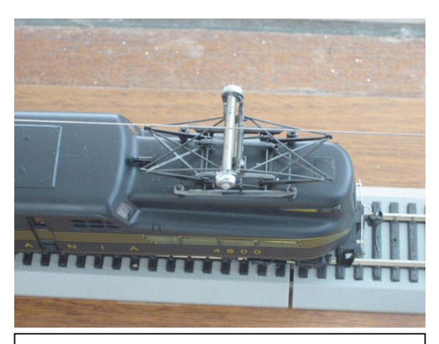
Figure 8: When John Henry Was A Little Baby, Le Havre Biennale, France, 2008.

For the Sonambiente Festival in Berlin in 1996 I built a variation, When John Henry Was A Little Baby , for exhibition in an old single-lane bowling alley: two parallel tracks (in the large scale used by Märklin) ran the length of the tunnel-shaped room, with a wire above each; the pantograph on each engine (I chose model streetcars) scraped the wire above it; each wire was highly amplified and distorted through a Marshall amplifier at one end of the tunnel; the scraping pantographs produced a wonderful racket (like dragging a pick along a string), and every time an engine came to a halt a harmonic rang out. The audience could control the movement of the auto-reversing trains from the opposite end of the tunnel from the amplifiers.