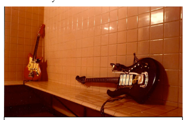
Figure 3: Installation of A Clearing of Deadness At One Hoarse Pool , Media Study Buffalo, 1983.

I created an audio installation ( Killed In A Bar , 1982) using similar technology: a guitar hung on the wall with two transistor radios, each tuned to a different station and connected to one of the two pickups. An electric clock motor turned a cam that moved the whammy bar in and out, causing the pitch of the filtering to sweep up and down in a slightly queasy manner. This was first shown in "Sound Corridor", an early exhibition of Sound Art curated by William Hellermann at PS1 in Long Island City. A multi-guitar variant was installed in the steam rooms of the legendary empty swimming pool at Media Study Buffalo in 1983<sup>10</sup>.