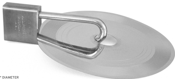
IMAGE: "SECRET", 1998 METAL DISC AND PADLOCK DISC 7" DIAMETER CHRISTIAN MARCLAY EDITION OF 5