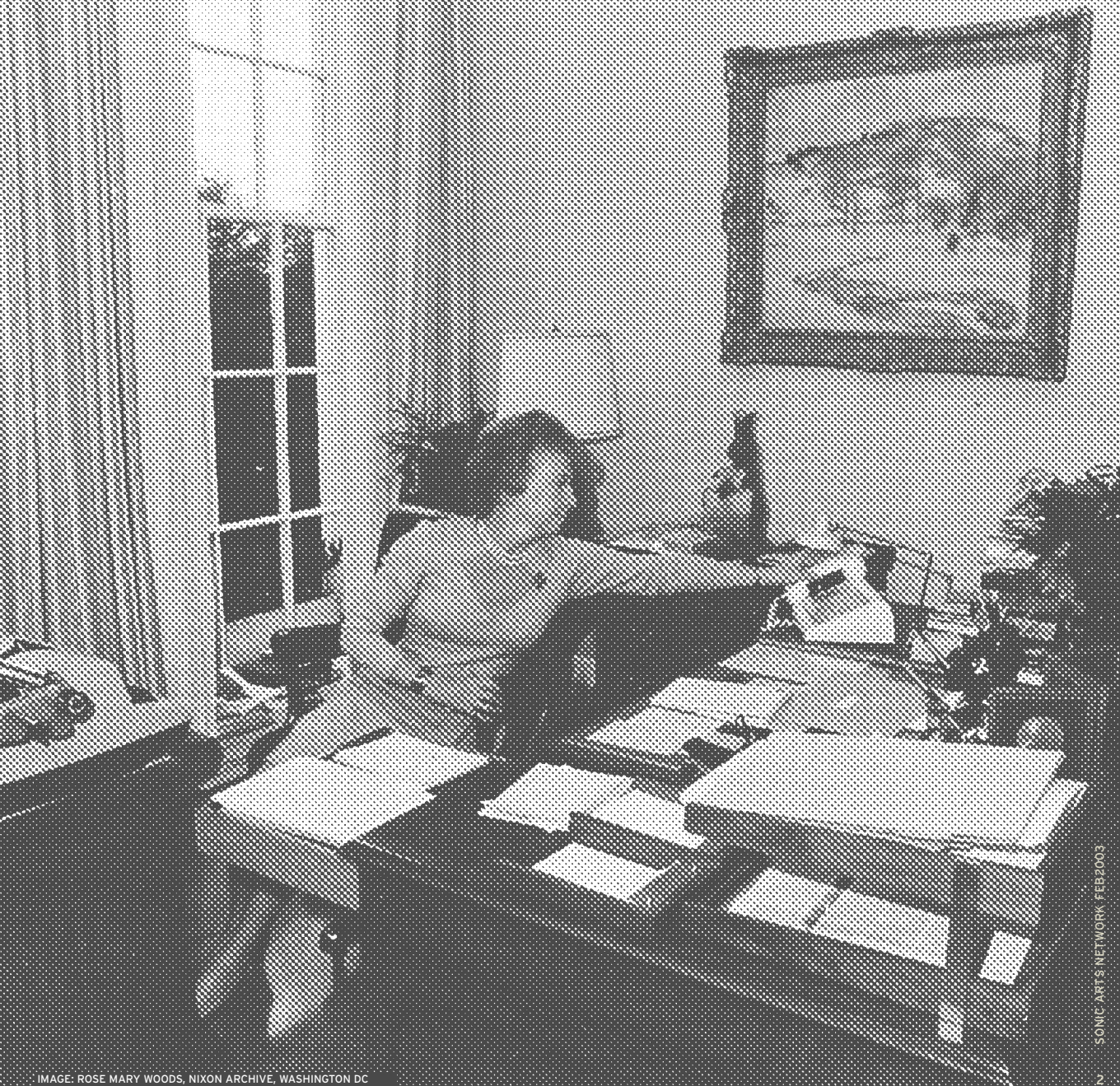
IMAGE: ROSE MARY WOODS, NIXON ARCHIVE, WASHINGTON DC